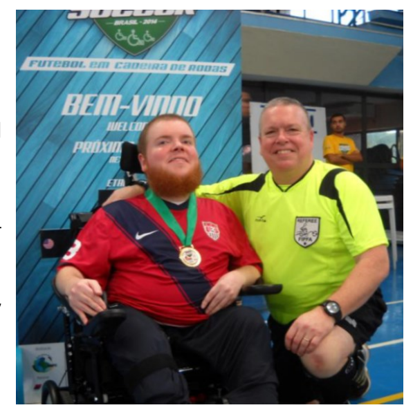
Mulhollands father and son at COPA AMÉRICAS Rio de Janeiro 2014

http://new.livestream.com/powersoccershop/copa-america-2014 and at www.youtube.com/watch?v=tccigjRvK_o. A comprehensive written account of the Tournament is posted on the Council 8240 website, www.kofc8240.org, under "News and Announcements."